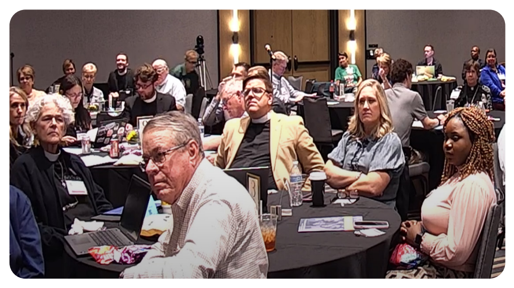
Members of Heavenly Rest at Diocesan Convention 2024